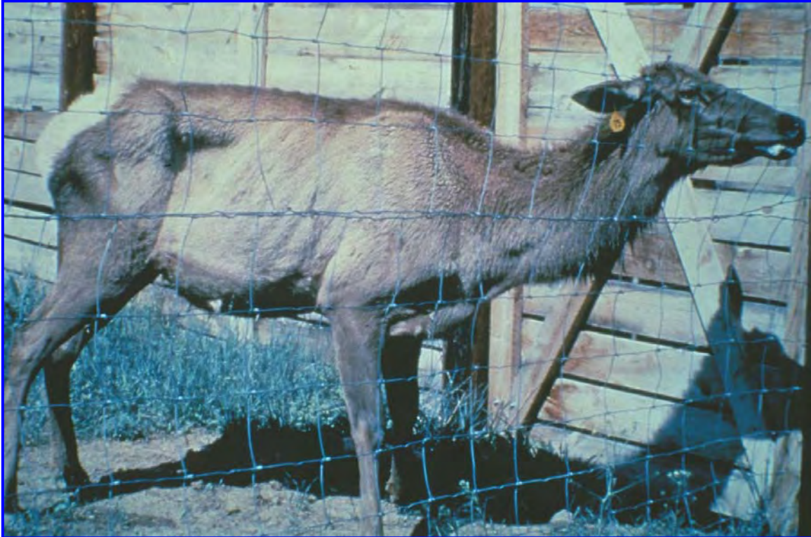
Figure 6. Captive elk infected with chronic wasting disease.

Department of Natural Resources, 2002 – see www.dnr.state.wi.us/org/land/wildlife/regs/02CWDregs.pdf ; New York Department of Environmental Conservation, 2003 – see www.dec.state.ny.us/website/regs/part189.htm ) have recently changed their regulations regarding artificial feeding and baiting in an effort to prevent or reduce infection of wild cervids with CWD.