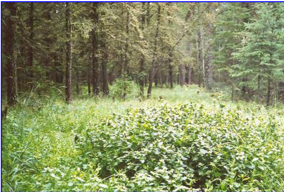
Figure 11. From native forest to introduced plants – exotic plant species thriving along an ungulate shooting lane in Saskatchewan.