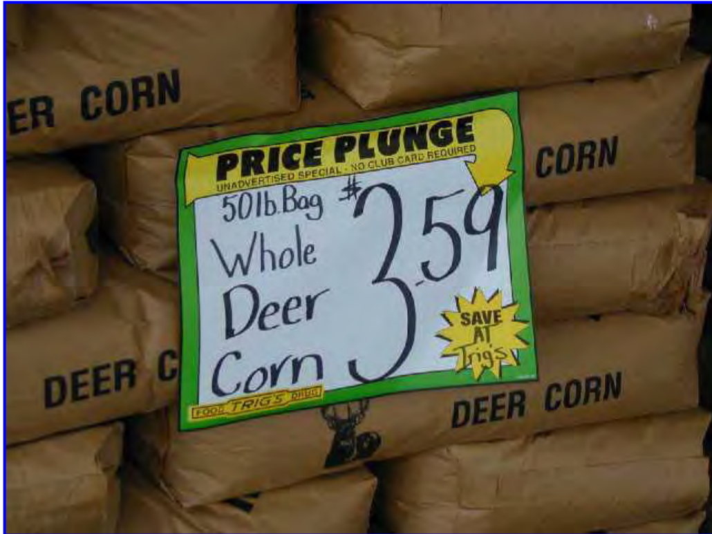
Figure 9. Bagged corn sold for the baiting of white-tailed deer in Wisconsin.

The cost of supplies and services are largely transparent – the manufacturer, distributor, or service sets a price and the consumer knowingly pays it. In contrast, the costs of maintaining artificial feeding programs or dealing with the negative ecological effects of providing food to wildlife (e.g., disease containment, habitat degradation) are often obscure, but generally considerable, long term, and borne by society as a whole. This is illustrated in the following examples: