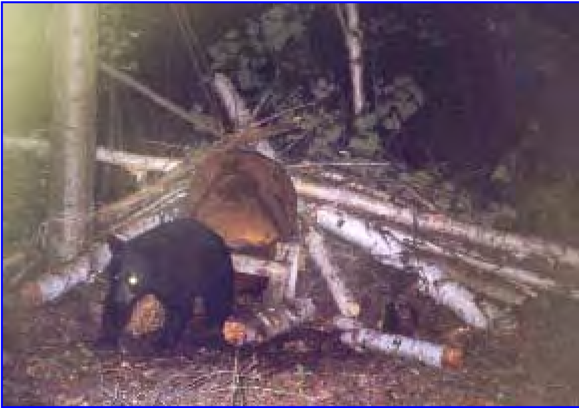
Figure 3. Black bear at bait site used for hunting.