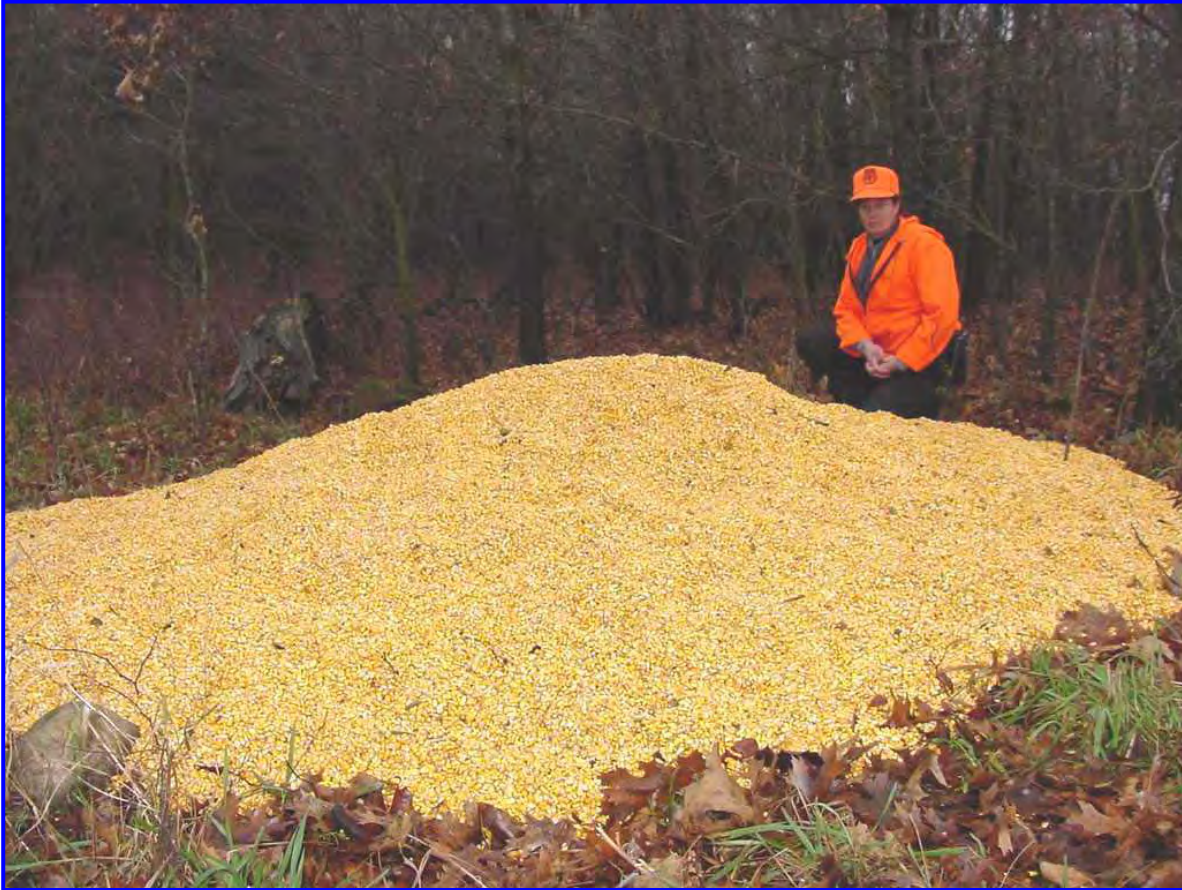
Figure 13. A Wisconsin conservation officer surveys a bait pile that exceeds the legal quantity restriction.