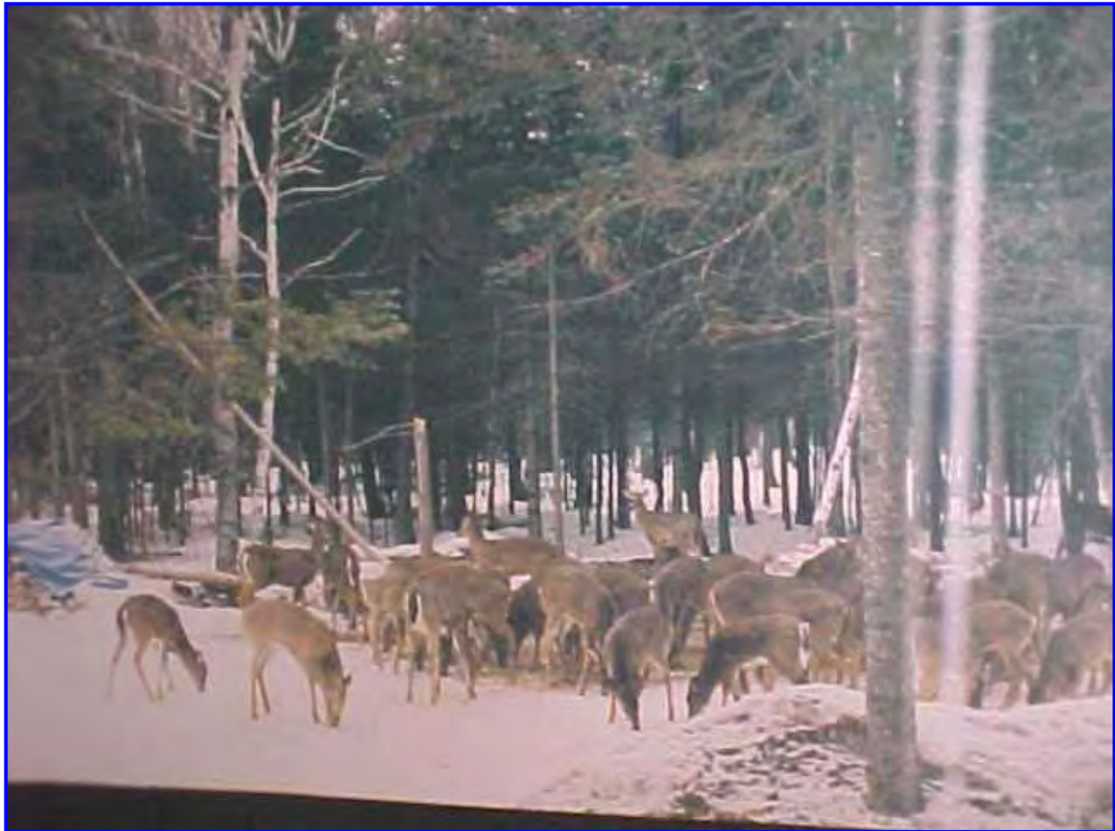
Figure 1. White-tailed deer at winter feeding site in Wisconsin.

It is important to realize that artificial feeding may also occur unintentionally. Garbage dumps, compost heaps, standing agricultural crops, and artificial environments such as golf courses are all potential sources of food used by wild species.