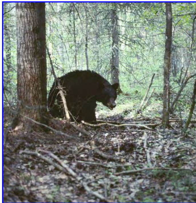
Figure 4. Black bear captured for research by bait and a leg-hold snare.