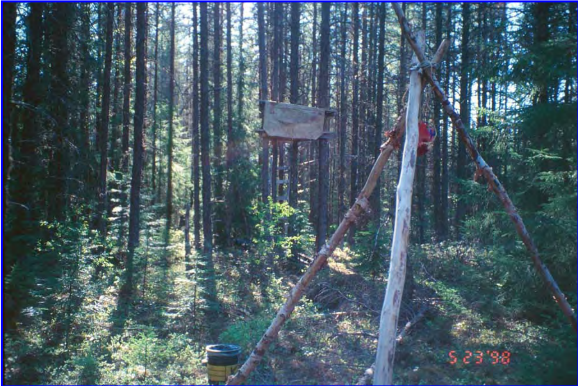
Figure 8. Shooting stand and bait site constructed for hunting black bears in Ontario.

less important to hunters than successfully killing a bear, regardless of its sex or age class.