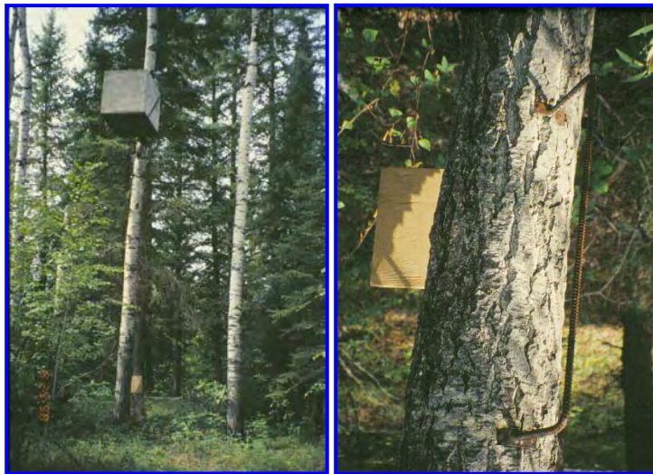
Figure 14. A permanent tree stand in the provincial forest of Saskatchewan.