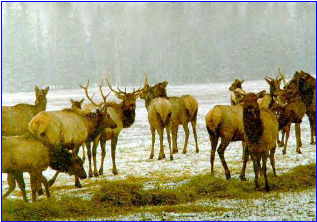
Figure 5. Artificial feeding is used to improve physical condition and reproductive success in a variety of wild species.