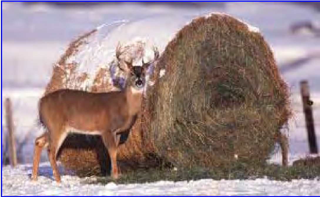
Figure 10. Albeit unintentional, standing agricultural crops, stored hay and grain, and livestock all represent potential sources of food for wildlife.