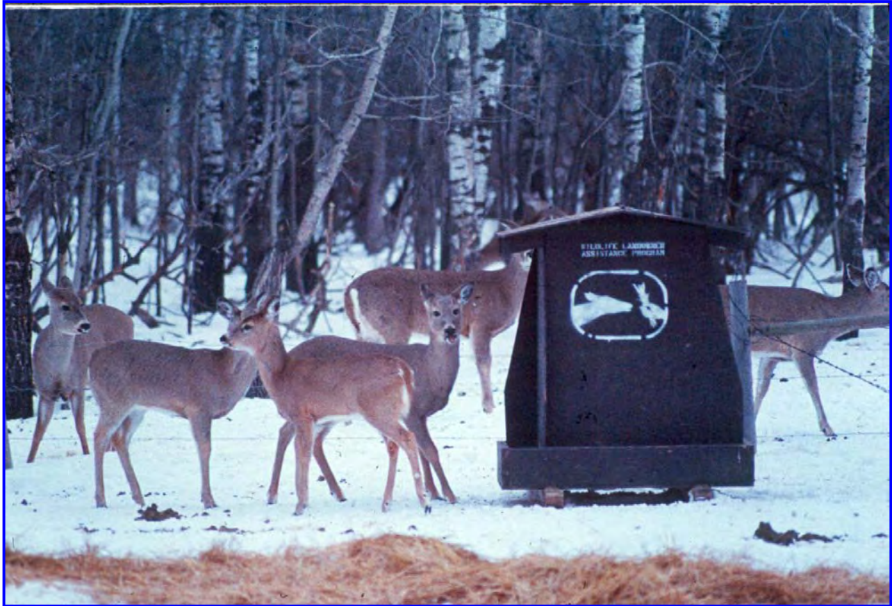
Figure 2. Intercept feeding white-tailed deer as part of the Wildlife Landowner Assistance Program in Saskatchewan.