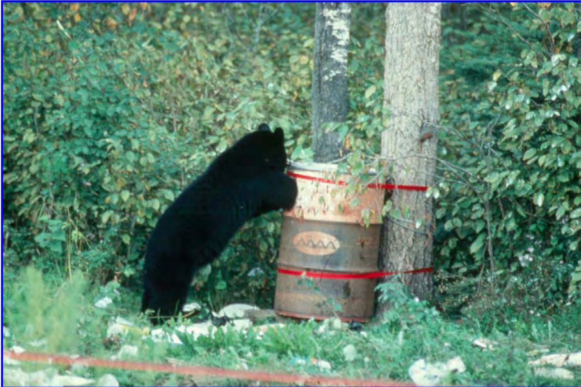
Figure 12. Black bears conditioned to human food sources may lose their natural wariness of people and become aggressive either in protection of, or in seeking other, human food sources.

http://www.serm.gov.sk.ca/media/saskatchewan%20environmentnewsline/reduce_bear_encounter.htm ; Alberta Sustainable Resource Development, 2002 – see http://www3.gov.ab.ca/srd/fw/bears/manage.html ; and Manitoba Conservation, 2002 – see www.gov.mb.ca/natres/wildlife/huntingg/general_information/notice.html ).