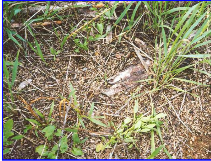
Figure 7. Exotic plant seeds left remaining and germinating at ungulate bait site in Saskatchewan.

Specific examples of effects on community processes include: